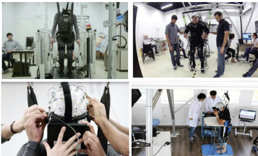
Fig. 4. Clinical Trial Lab Images, Duke University Medical Center.

Neurological recovery was paralleled by the emergence of lower limb motor imaging at cortical level. Researchers hypothesize that this unexampled neurological recovery results from both spinal cord and cortical sensitivity induced by long-term brain-machine interface usage, "Fig. 4" [46].