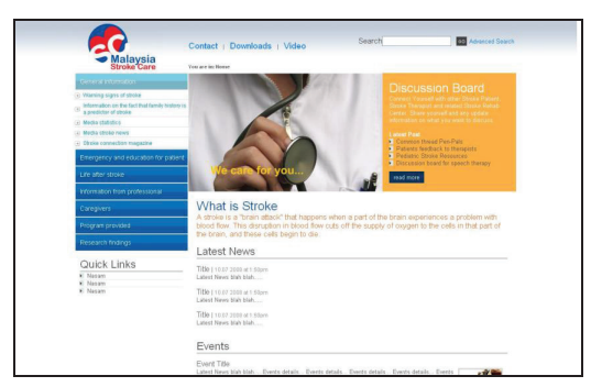
Figure 3: Prototyping of final-product

High fidelity prototyping is chosen as it is quite similar with the final products that allow user and developer to test the real functionality of the system developed. Four stages of prototyping involved in the design process involved three respondents from the same respondents of card sorting activity. They review the sketch of interface and provide feedback on the best design they prefer. Figure 2 shows prototyping of the sketch design for the main page. This will be the final product or user interface design that will be tested and verified with end user at the later stage.