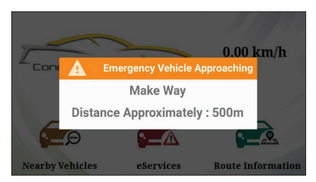
Fig. 7. Emergency Vehicle Warning

The emergency vehicle warning is the important element of the application. As the vehicle is moving on a particular road and an emergency vehicle is approaching towards the vehicle that is travelling along the road will receive an alert notification on the home screen as shown in Fig. 7.